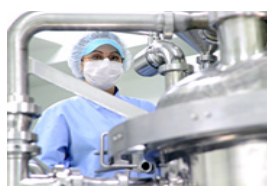
Laboratories & Clean Rooms