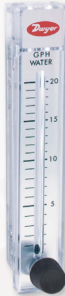
Model RMB-SSV 5" scale, 8-3/4" high