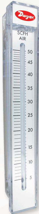
Model RMC 10" scale, 15-3/8" high